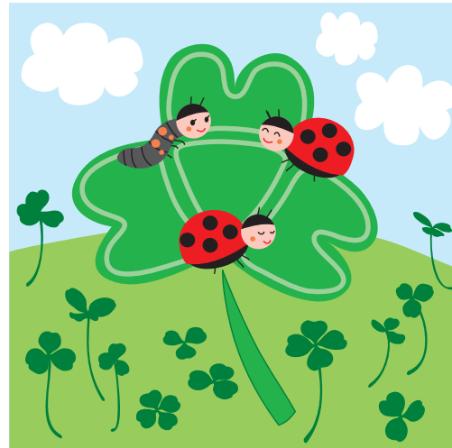
Fig. 4. Region Select for children

Since Region Select does not need words or numerical equations, we can imagine many kinds of applications of Region Select. For example, we expect Region Select will be used in primary education. We hope children enjoy this game and appreciate its graphics. Their ability to think ahead will be straightened by playing the game. Now we need to design the game for children as shown in Fig. 4 or [6]. We also expect to use Region Select for training cognitive functions to recognise shape during rehabilitation. Since this game is based on pure mathematics, we expect and believe that Region Select has limitless possibilities.